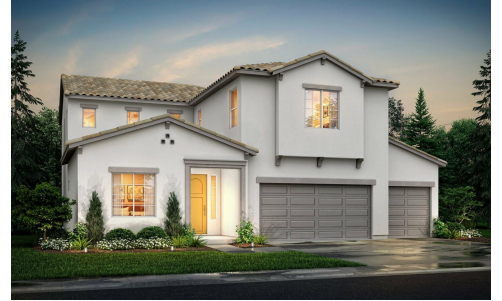
MODERN SPANISH ELEVATION