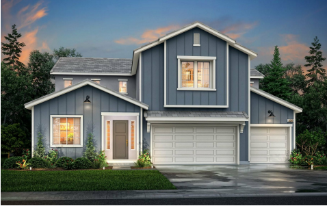
MODERN FARMHOUSE ELEVATION