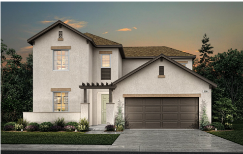
MODERN SPANISH D