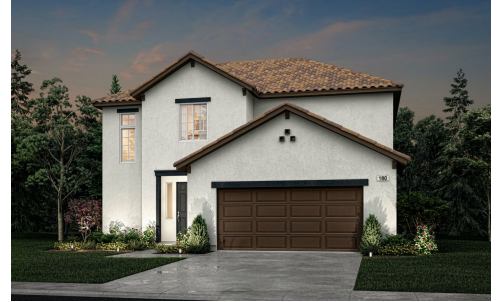
MODERN SPANISH C