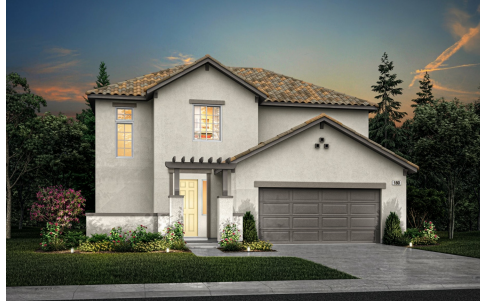
MODERN SPANISH B