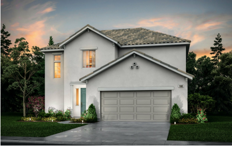
MODERN SPANISH A