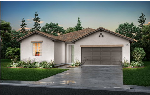
MODERN SPANISH D