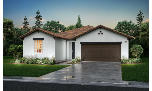
MODERN SPANISH C