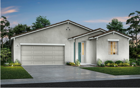
MODERN SPANISH A