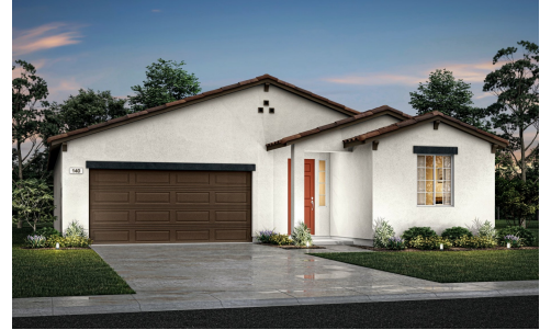
MODERN SPANISH C