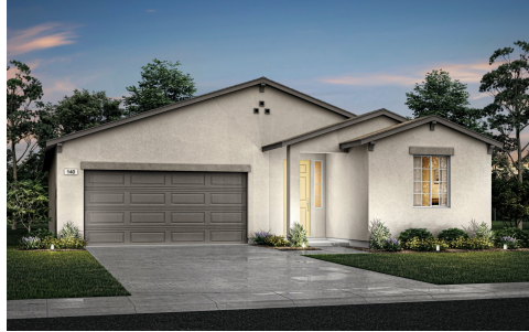
MODERN SPANISH B