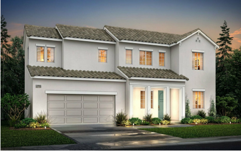
MODERN SPANISH ELEVATION