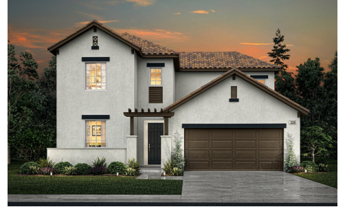
MODERN SPANISH C