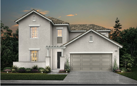
MODERN SPANISH A