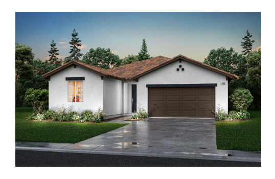
MODERN SPANISH C