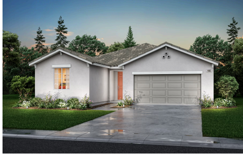
MODERN SPANISH A