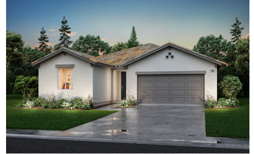
MODERN SPANISH B