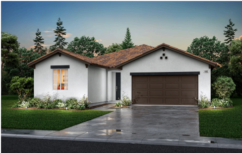
MODERN SPANISH C