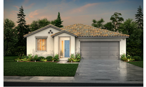
MODERN SPANISH B