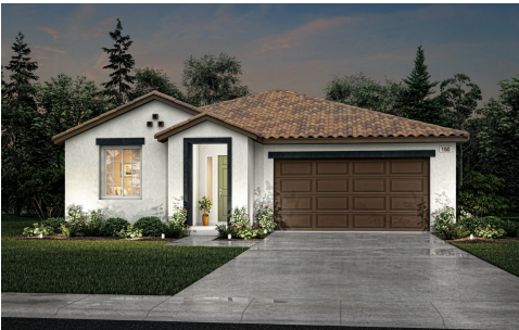
MODERN SPANISH C