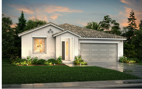
MODERN SPANISH A