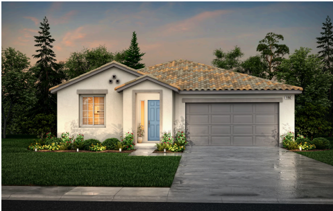
MODERN SPANISH B