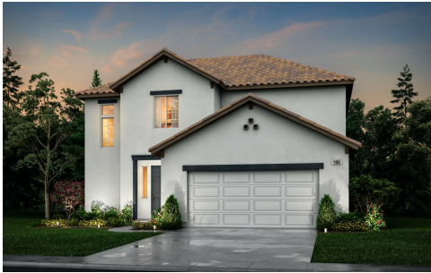
MODERN SPANISH D