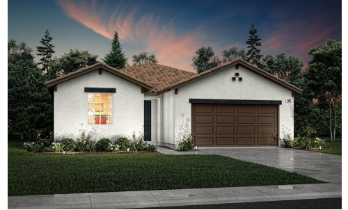
MODERN SPANISH C